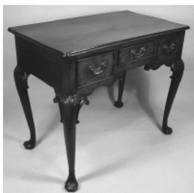
George II Elm Lowboy, mid-18th c., possibly Irish Estimate: $3000 - $5000 Sold for $16,215

www.litchfieldcountyauctions.com ; 860-567-4661