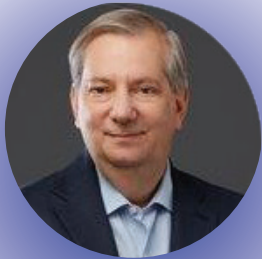
Steven R. Schindler President's Award

Thursday, November 10 | 1:00 pm EST | Networking Luncheon