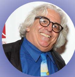
William Roland Director's Award